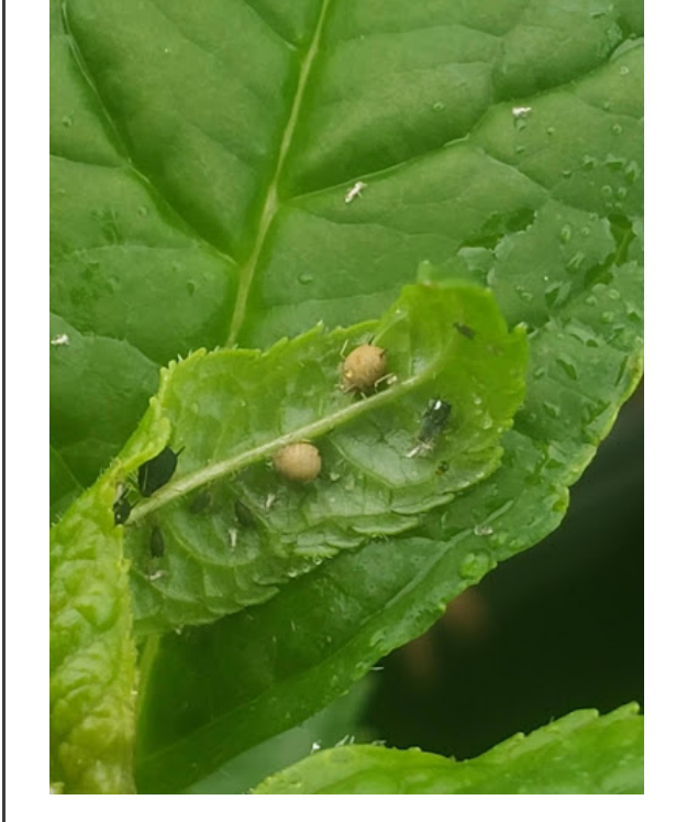
Aphid "mummies", parasitized insects and nymphs.